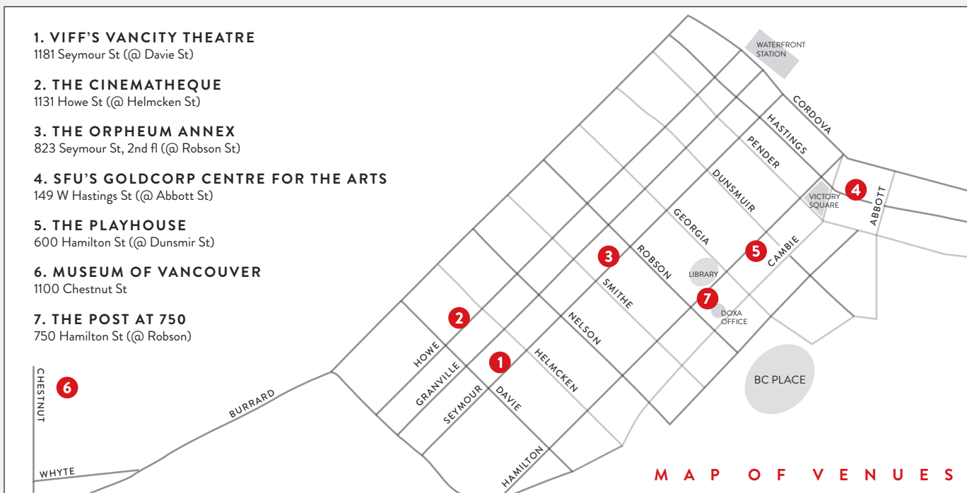
M A P O F V E N U E S